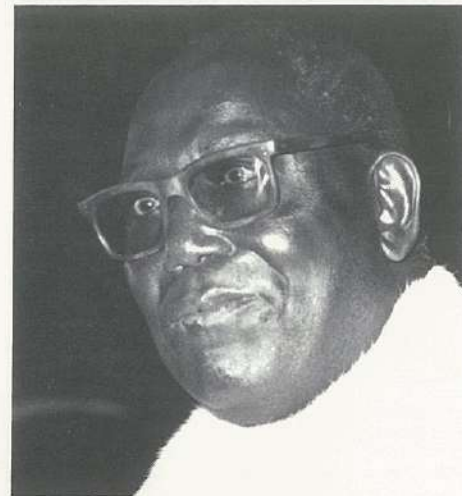
Hon. President Alphonse Boni

Considérant qu'il résulte des éléments soumis à la Cour que, au moment de l'adoption de la résolution 3292 (XXIX), la Mauritanie avait invoqué des considérations diverses à l'appui de l'intérêt particulier qu'elle portait au territoire du Sahara occidental; que cependant, aux fins de la présente question préliminaire qu'est la composition de la Cour en l'affaire, ces éléments paraissent indiquer que, au moment de l'adop-