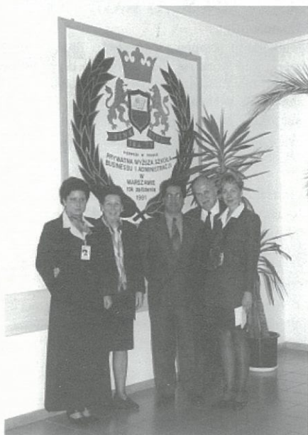
WJA officers and College representatives

Destroyed and rebuilt again and again, Warsaw has proven itself one of the strongest cities in the world. For this reason, the WJA is honored to be welcomed to Warsaw for its June Conference. Further information on Warsaw, including a pictorial and registration form, can be found throughout this newsletter.