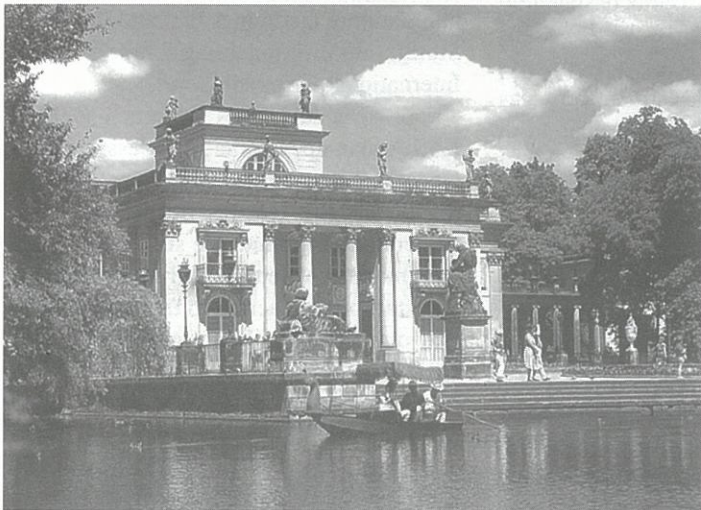
The Palace on the Water

Wilanow Palace, a beautiful Baroque castle built for King John III Sobieski and his wife Mrysienska, dates back to the late 17th Century. The design was created by Augustyn Locci and other outstanding artists and architects, including Michelangelo Palloni and Andrzej Schluter. After the King's death in 1696, the Wilanow residence fell into decline. However, it was saved by Elzbieta Sieniawska who bought it in 1720 and restored it throughout the first half of the 18th Century. The palace passed through many hands before it was finally renovated into a museum after the end of the Second World War. Today, Wilanow Palace houses an extensive art collection and portrait gallery in the main hall as well as a poster museum in one of its outlying buildings. In addition to the wonderful sights inside the palace, visitors must not leave without spending time admiring the beautiful surrounding gardens.