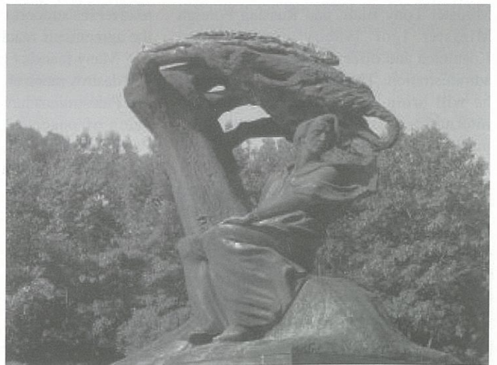
Statue of Polish Composer Frederic Chopin

Below you see Frederyk Szopen (Frederic Chopin) under a willow tree. This monument is dedicated to the great Polish composer and, like the Palace on the Water, is located in the beautiful Lazienki Park. The memorial, designed by Waclaw Szymanowski, serves as the site for free public concerts of Chopin's music every summer.