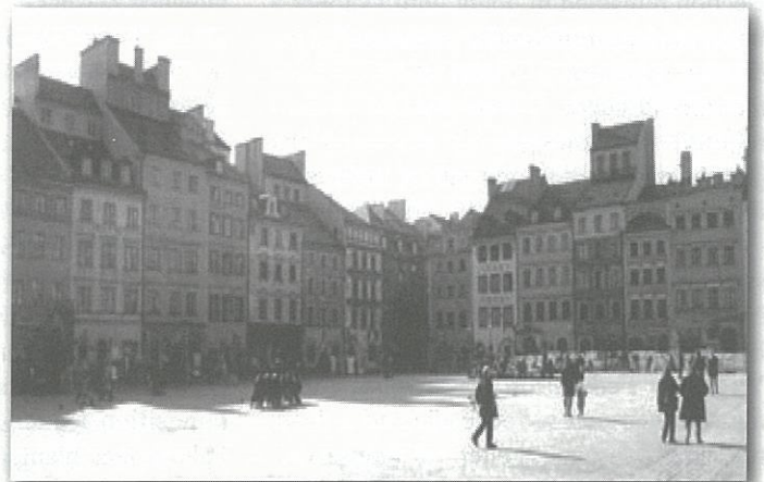
Historic Old Market Square

Old Market Square is notoriously the most beautiful place in all of Warsaw. The present plan of the old town square dates back to the 14th Century, while the current shape of the square dates mainly to the 17th Century when the rich merchant families built their homes here. The row houses themselves showcase many great architectural elements from Gothic to late Renaissance, Baroque, and Neo-Classical styles. Although completely destroyed during World War II, the old town was rebuilt with great precision after the war. Today, it is a major tourist attraction where one can find many restaurants, pubs, cafés, and gift shops. Old Market Square is particularly charming and romantic at night when its facades are masterfully lit up with alternating shadows and lights.