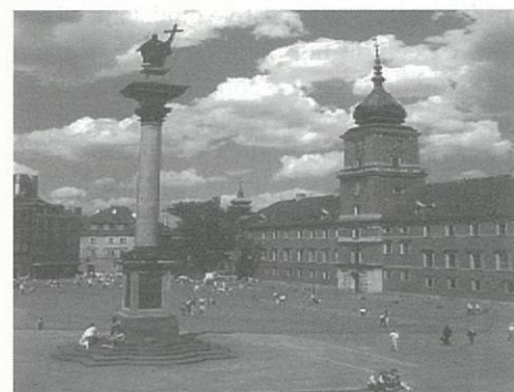
The Royal Castle

On November 11, 1918, Poland regained its independence. However, the growth of the country would not last long.